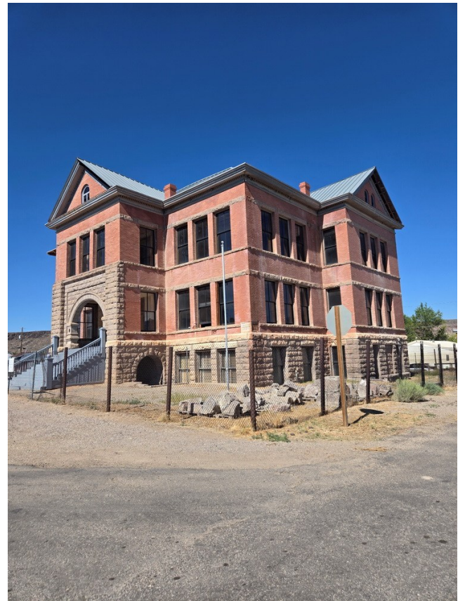
The picture on the left shows the high school in November 2023 and the one above in August 2024. What a difference 9 months makes!